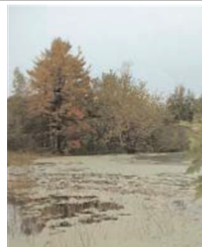
High phosphorus levels in lakes cause dense algae blooms, which can accumulate along the shoreline as shown above.