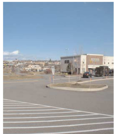
The amount of phosphorus exported from a project site will depend on the land use and soil type, with greatest exports from impervious surfaces as the one shown here.

Use the first four columns in Worksheet 2 in Appendix D to calculate the Pre-PPE.